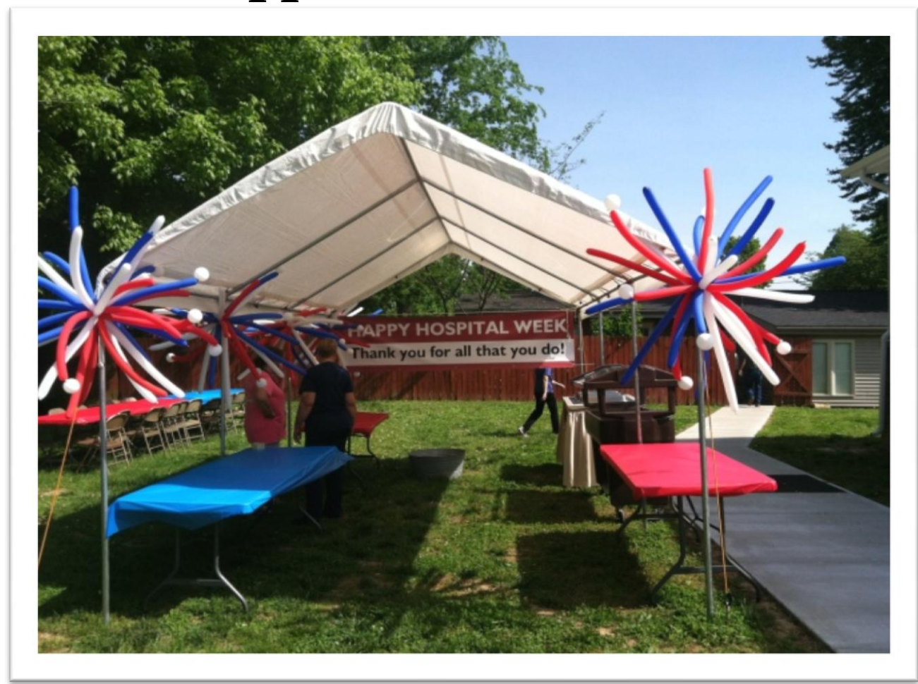
Massac County Hospital Appreciation