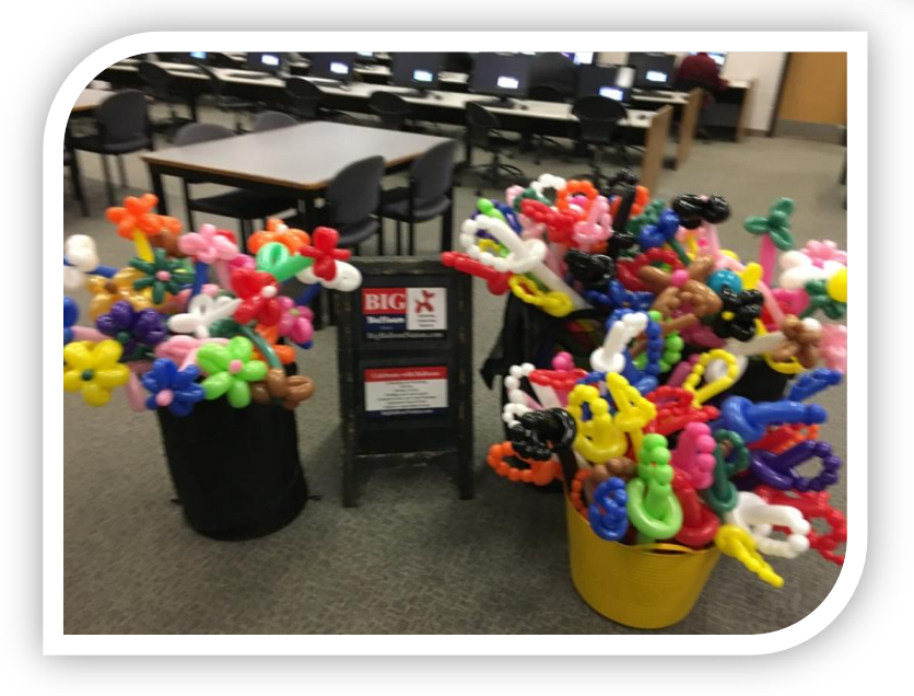
1st 100 prizes