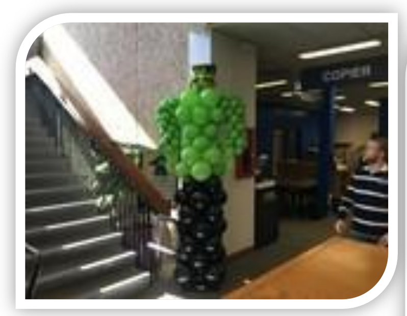
9 Feet Tall