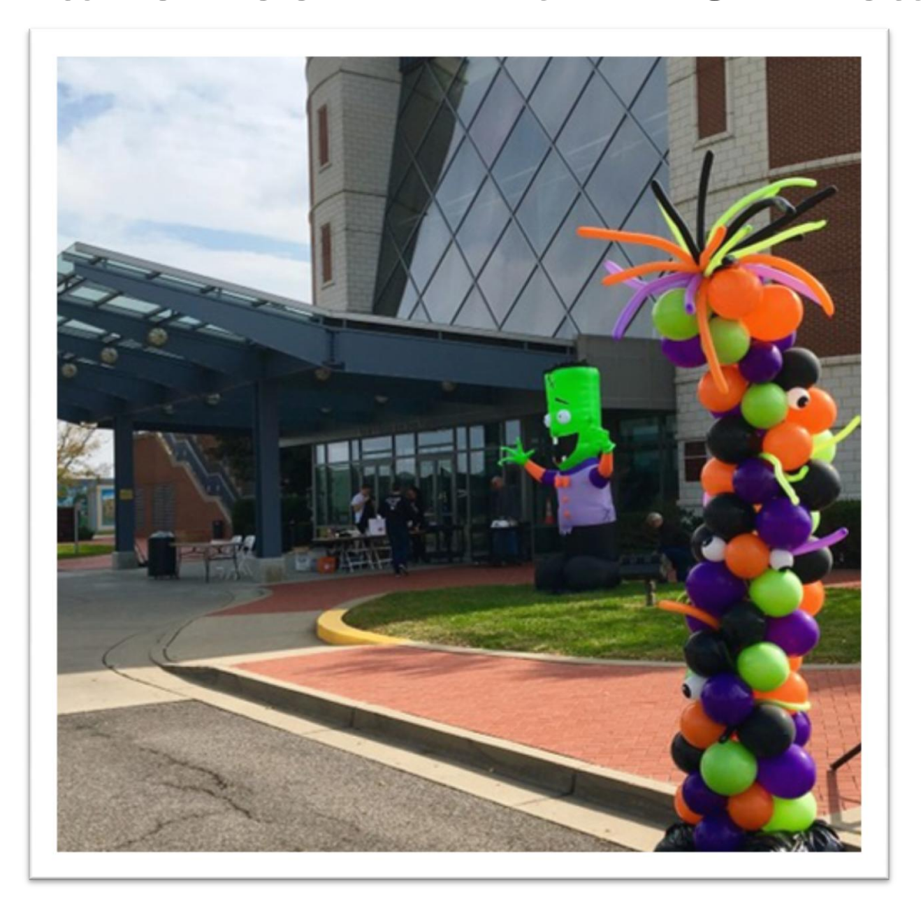
Carson Center Monster Mash and 5K Bash