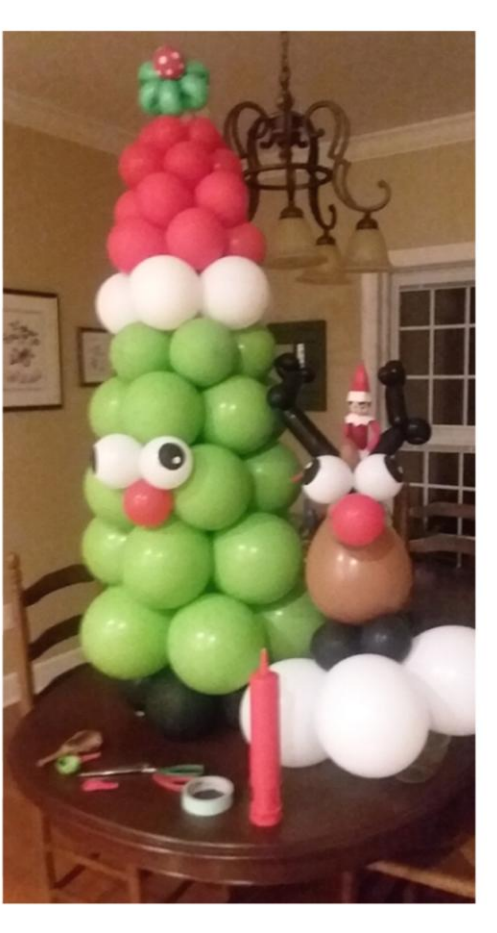
Elf on the Shelf